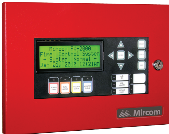
RAX-LCD mounted in a BB-1001R enclosure

The FX-2000 Analog Fire Alarm Control Panel supports Programmable modules which can be connected either internally to the fire alarm panel or externally via the RAX-LCD Remote Shared Display. Connection to the RAX-LCD allows for unique configurations for a specific remote location.