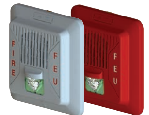
Wall Mount Speaker/Strobes