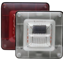
Weather Protected Wall/Ceiling Mount Horn