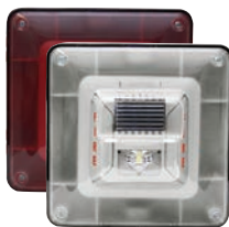
Weather Protected Wall Mount Horn/Strobe