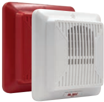
Low Frequency Wall/Ceiling Mount Sounder