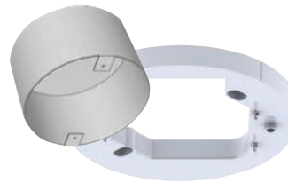
Ceiling Mount Accessories