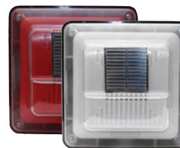
Weather Protected Wall/Ceiling Mount Speaker