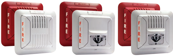
Wall/Ceiling Mount Horns