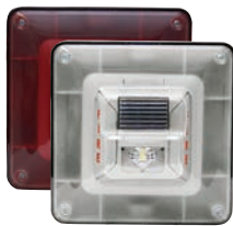
Weather Protected Wall Mount Strobe