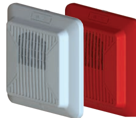
Wall Mount Speakers