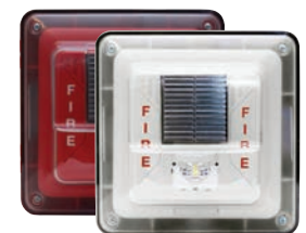
Weather Protected Wall Mount Speaker/Strobe