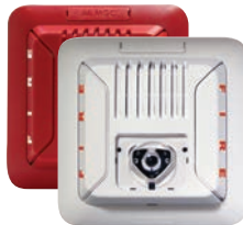
Ceiling Mount Horns/Strobes