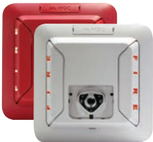
Ceiling Mount Strobes