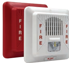
Low Frequency Wall Mount Sounder Strobe