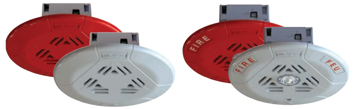
Ceiling Mount Speakers