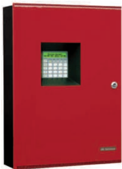
Model MR-2306 shown