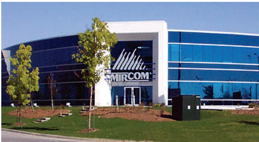
Corporate head office and manufacturing facility, Vaughan, Ontario, Canada

25 Interchange Way Vaughan, Ontario L4K 5W3 Tel: 905.660.4655 Fax: 905.660.4113