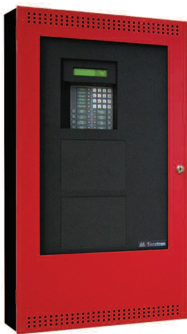
Model MR-2351 shown