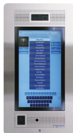
TX3 TOUCH 22" (Flush Mount)