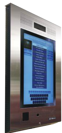
TX3 TOUCH 22" (Surface Mount)