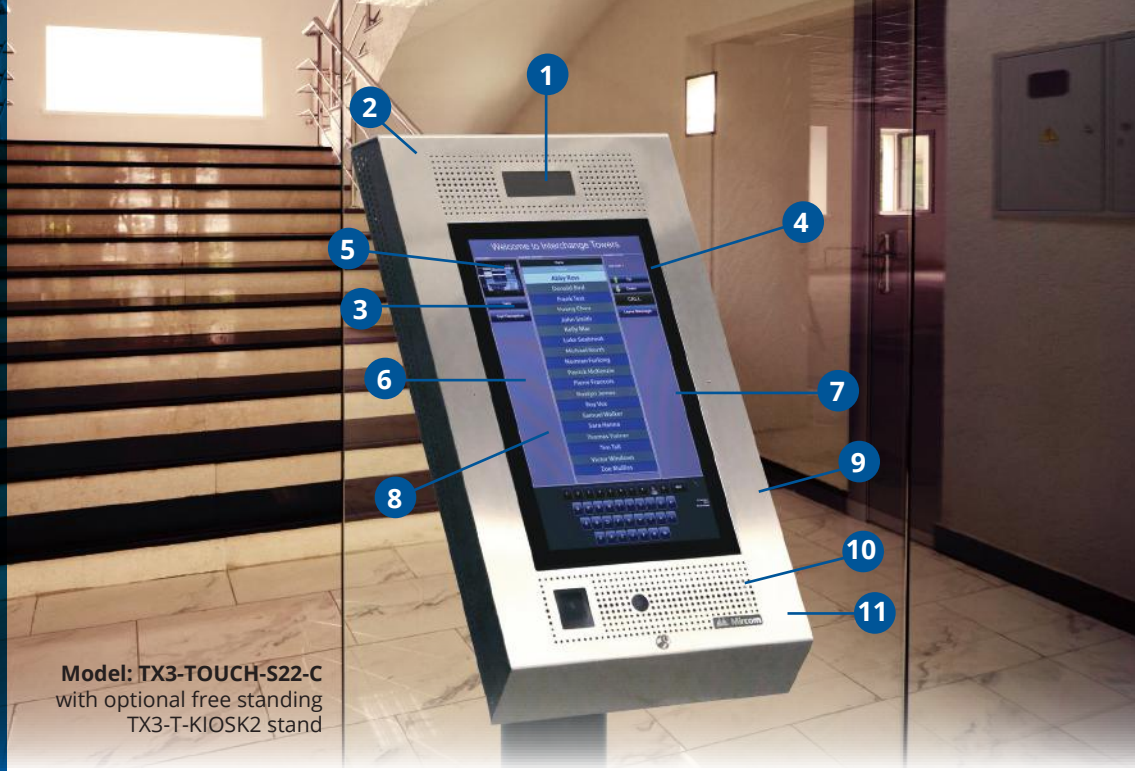
Model: TX3-TOUCH-S22-C with optional free standing TX3-T-KIOSK2 stand