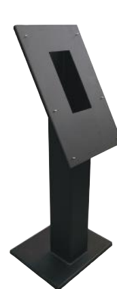
TX3-T-KIOSK2 Square Pillar