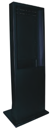
TX3-T-KIOSK3 Enclosed Pillar