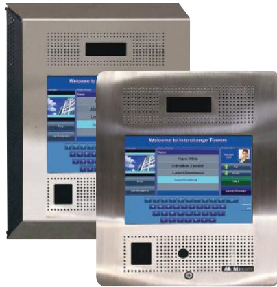
TX3-TOUCH-S15-C (Surface Mount) TX3-TOUCH-F15-C (Flush Mount)