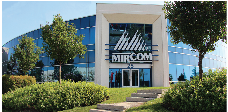
Corporate head office and manufacturing facility, Vaughan (Toronto), Ontario, Canada

25 Interchange Way Vaughan, ON L4K 5W3 Tel: 905.660.4655 Fax: 905.660.4113