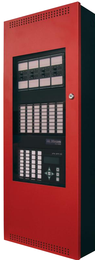
FX-2003-12NXTDS in a BBX-1024XTR enclosure (with optional DSPL-420-16TZDS Main Display module)

FleX-Net complies with the latest fire codes and standards, for control units (listed with UL 864, 9th Edition and ULC S527) and installation (NFPA, ULC S524). FM certified.