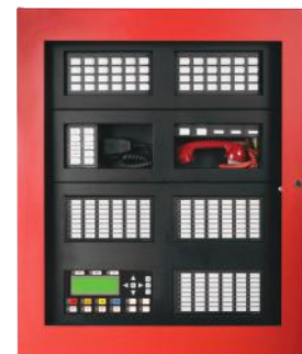
BB-5008 with a DOX-5008MR