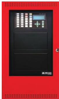
UB-1024DS with a DOX-1024DSR

Designed for peer-to-peer network communications, the various Flex-Net network panels allow for a maximum of 63 nodes, while providing reliability, flexibility and expandability.