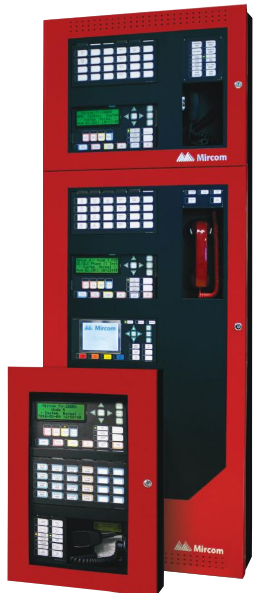
FleX-Net Mass Notification Systems – Autonomous Control Unit (ACU) and Local Operating Console (LOC).