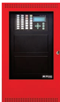
UB-1024DS with a DOX-1024DSR

Designed for peer-to-peer network communications, the various Flex-Net network panels allow for a maximum of 63 nodes, while providing reliability, flexibility and expandability.