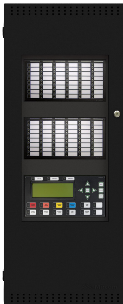
FX-4003-12NXT in a BBX-1024XTB enclosure (with optional DSPL-420-16TZDS Main Display module)

FleX-Net complies with the latest fire codes and standards, for control units (listed with UL 864, 10th Edition and ULC S527-11 3rd Edition) and installation (NFPA, ULC S524). FM certified.