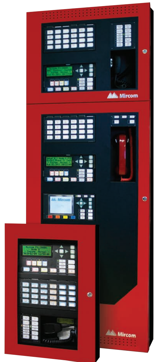
FleX-Net Mass Notification Systems

Autonomous Control Unit (ACU) and Local Operating Console (LOC).