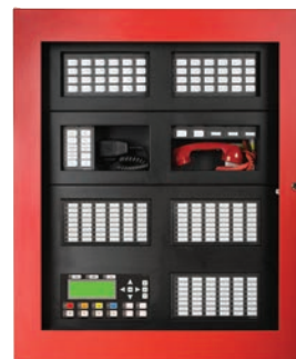
BB-5008 with a DOX-5008MR

Expandable to 21 Intelligent Signaling Line Circuits (SLC) with up to 9 expansion modules, available in a variety of enclosures