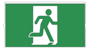
Without Arrow 1 pc