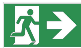
With Arrow 2 pcs