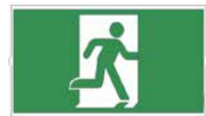
Without Arrow 1 pc