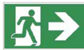
With Arrow 2 pcs