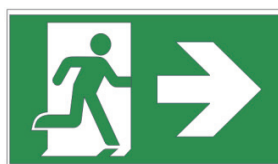
With Arrow 2 pcs