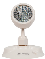
EL-7030A (1.5W) EL-7030A5 (5W)