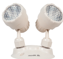
EL-7030B (3W) EL-7030B10 (10W)