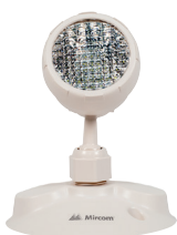
EL-7030A (1.5W) EL-7030A5 (5W)