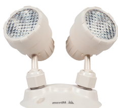
EL-7030B (3W) EL-7030B10 (10W)