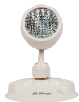
EL-7030A (1.5W) EL-7030A5 (5W)

Unit comes with two attached 5W light heads. You can add on up to 85W of additional remotes for 30 minutes comprised of one or a combination of the following: