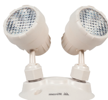
EL-7030B (3W) EL-7030B10 (10W)