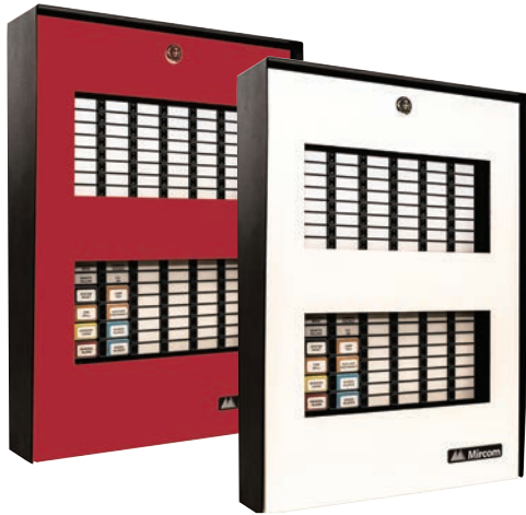
BB-1002WPRA / BB-1002WPA