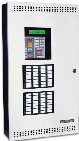
FX-353-LW with optional RAX-332 Programmable LED Annunciator