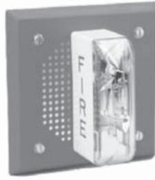
E-70 Series + LS