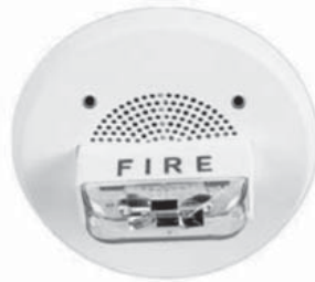
E-90 Series + LS