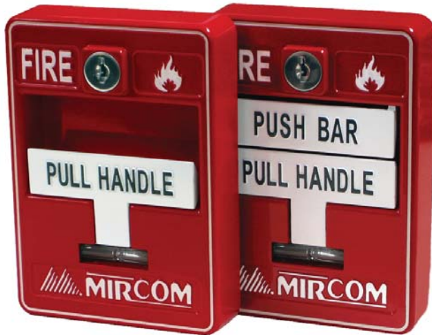
MS-701ADU Intelligent Addressable Single Action Manual Station