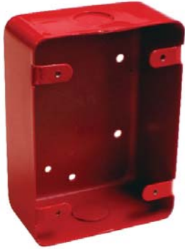
BB-700 Surface Mount Backbox