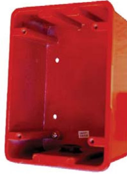
BB-700WP Weatherproof Surface Mount Backbox