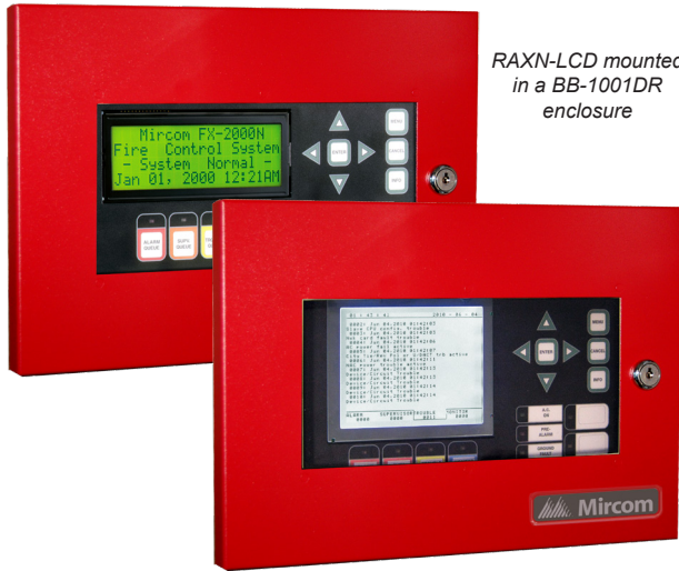
RAXN-LCD mounted in a BB-1001DR enclosure