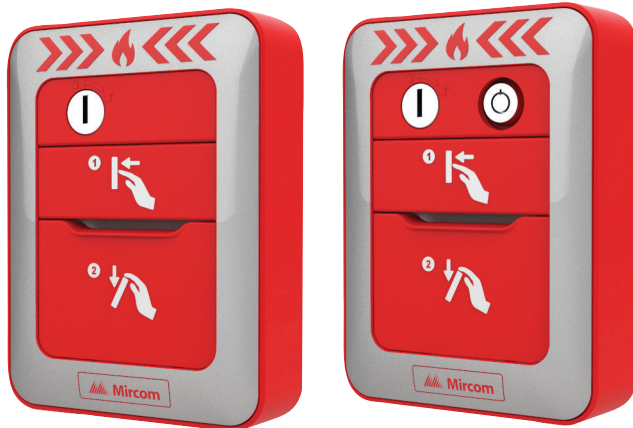
MPS-810MP(U) 1 Stage