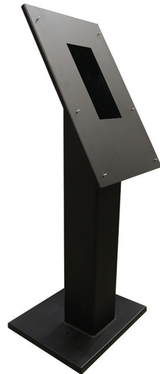
TX3-T-KIOSK2 Optional Black Pedestal