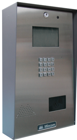
Surface Mount Universal Enclosure