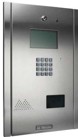
Flush Mount Continental Enclosure