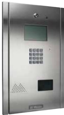
Flush Mount Continental Enclosure