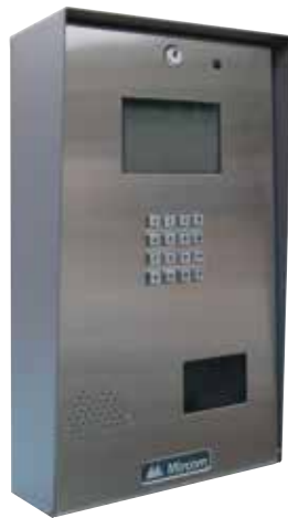
Surface Mount Universal Enclosure