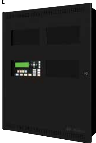
FX-4017-12N and DSPL-420DS (sold separately) Display, Backbox and Door are sold separately