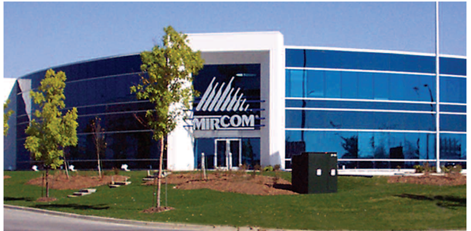
Corporate head office and manufacturing facility, Vaughan, Ontario, Canada

25 Interchange Way Vaughan, Ontario L4K 5W3 Tel: 905.660.4655 Fax: 905.660.4113