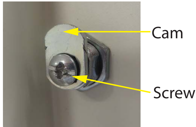
Figure 1 Remove the screw and cam