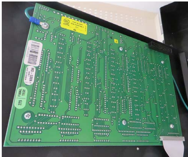
Older versions of FA-1008KA: