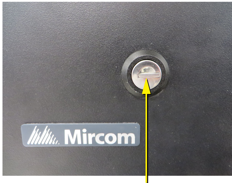
Keyhole is horizontal when locked