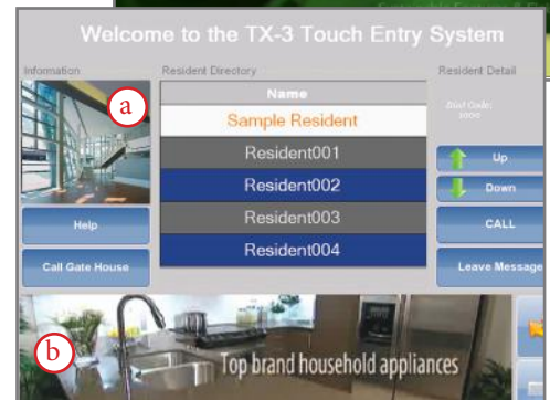
3 Banners positions: a,b,c