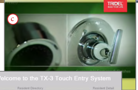
Sample Video: Screen Saver

Visitors to the building will be presented with the ad/promotion when they approach the unit, as a screen saver, over a main video, while using the application, appear as a call banner when they have completed their call to the building resident.