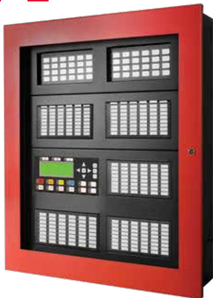
FX-2009-12NDS in a BB-5008R enclosure.