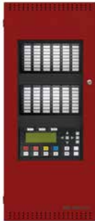
FX-2003-12NXTDS in a BBX-1024XTR enclosure with two optional RAX-1048TZDS modules